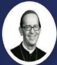
MOST REV. THOMAS OLMSTED

Please note there is $100 discount if you use the promo code: SOCAL