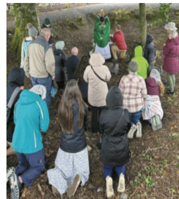
2. IMMACULATE CONCEPTION